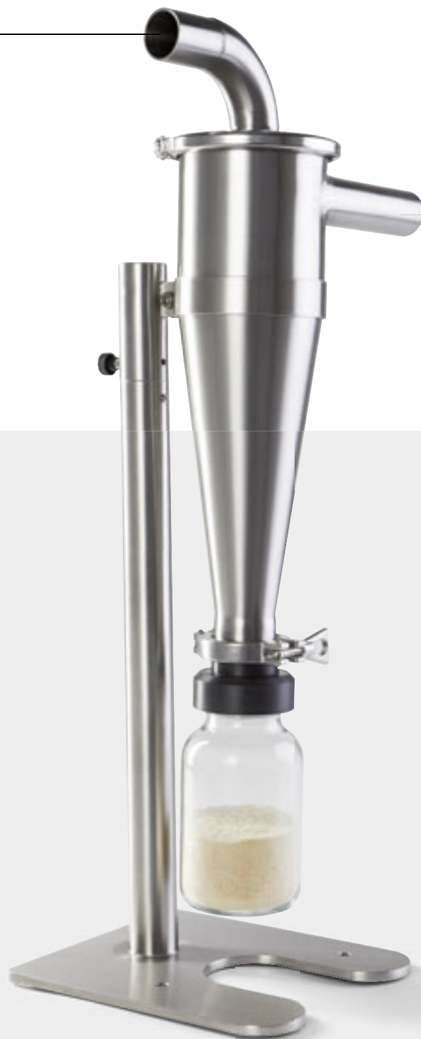
Compact and powerful: the FRITSCH high-performance Cyclone separator made of stainless steel

The powerful airflow enables the use of finer sieve rings to achieve a higher final fineness – even for materials, which are otherwise difficult to grind finely, such as electrostatically-charged plastics or powder coatings. Especially convenient: the ground sample is drawn directly into the screwed-on sample glass, in which it can be transported, stored and easily removed for analysis.