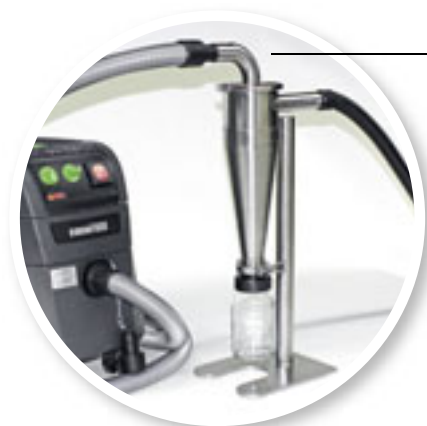
Especially convenient: direct exhaust into the sample glass

Cool, clean and convenient: FRITSCH Cyclone separators for sample exhaustion open up new possibilities, which would otherwise be impossible. The powerful airflow of the Cyclone separators ensures simple feeding and faster throughput. Due to faster operation and the additional stronger cooling, the thermal load of the sample materials is minimized, so that temperature-sensitive samples can also be ground without any problems.