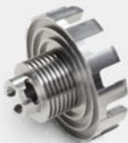
Impact rotor with cooling fins

The strong airflow produced by the motor, an ingenious air routing, as well as special cooling fins on the rotors further intensify cooling. Your advantage: melting or sticking is greatly reduced, even with temperature-sensitive samples. The cooling function can easily be enhanced further by utilizing the integrated option to connect an exhaust system or a FRITSCH Cyclone separator.