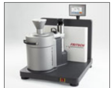
Intelligent AutoLOCK grinding chamber enables incredibly simple operation