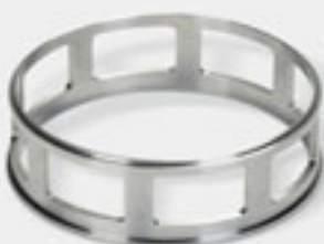
Impact bar for gentle comminution

The FRITSCH impact bar is the ideal solution for very gentle grinding of especially heat-sensitive materials such as powder coatings or plastics as well as for the smooth pre-crushing and fine comminution of hard-brittle to soft, fatty or samples with residual moisture. The impact bar acts as a stator on which the material is additionally beaten. The result: increased grinding performance for a particularly fast and efficient grinding that minimises the thermal load. The corresponding impact rotor and a special sieve ring for the impact bar must be ordered separately.