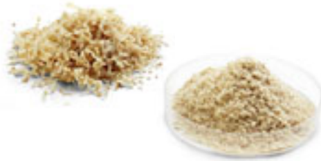
Optimal preparation of a wood sample with the cutting rotor

Available only from FRITSCH: With the cutting rotor the PULVERISETTE 14 premium line is ideal for fast, efficient pre-grinding of fibrous materials and plastics. Just order the cutting insert consisting of a cutting rotor with straight cutting edges and cooling fins, collecting vessel, labyrinth disk and sieve shells holder with fixed knives. Select additionally a set sieve shells with trapezoidal or round perforation to determine the desired final fineness. The materials are ground by cutting and shearing forces. The PULVERISETTE 14 premium line detects the labyrinth disk and automatically operates in an optimized mode with up to 10,000 rpm. And the use of a FRITSCH Cyclone separator will further improve throughput and cooling.