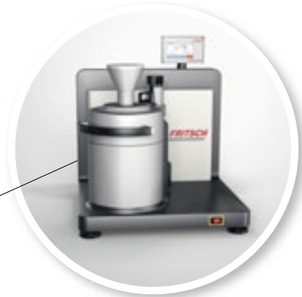
Simple connection to the PULVERISETTE 14 premium line

Samples which are difficult to grind or extremely temperature-sensitive (e.g. plastics) can be embrittled with the addition of liquid nitrogen and subsequently ground in the PULVERISETTE 14 premium line .